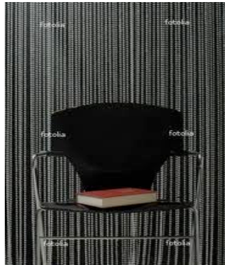
In amoxtli ipan icapalli ca.