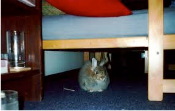
In tochtli itzintlan onoyan/talpechtli ca.

Write the sentences for these pictures.. Use the vocabulary in this and previous lessons.