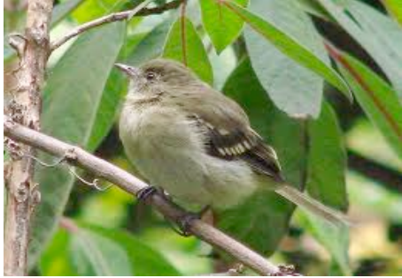
In tototl ipan cuammaitl ca.

Write sentences for these pictures. Use vocabulary from this and previous lessons.